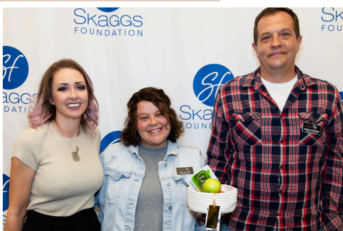
House of Hope: Motel Closure Emergency Response