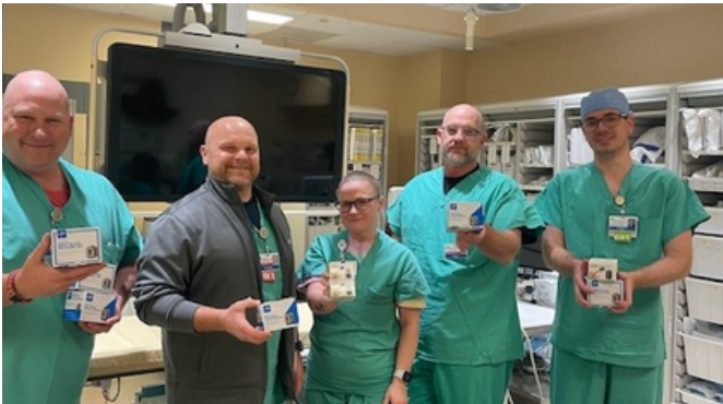
Cox Medical Center Branson Cath Lab: Blood Pressure Cuffs

At Skaggs Foundation, every dollar entrusted to us reflects a donor's faith in our mission—and we don't take that lightly. Stewardship is not just a responsibility; it's our promise.