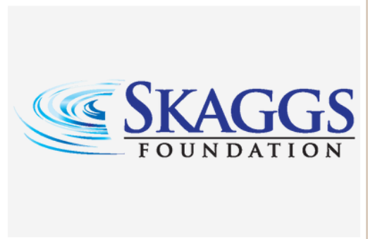
Original Skaggs Foundation Logo