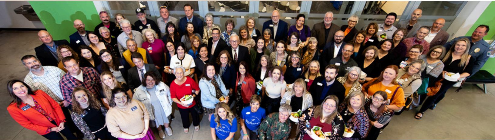
2024 Skaggs Legacy Endowment Grant Recipients

Naming Skaggs Foundation in your estate plan is a powerful way to continue your impact for generations to come—and it's easier than you might think.