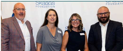
Christian Action Ministries: Community Garden

Providing access to screenings, cleanings, fluoride treatments, and restorative dental care for children and families who might otherwise go without.