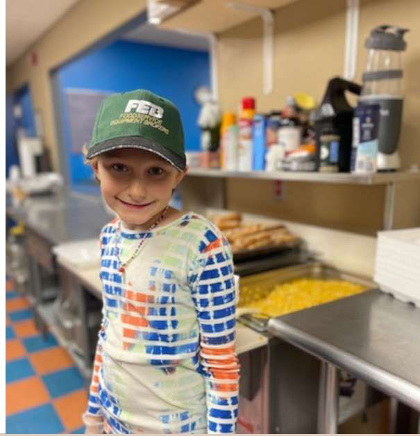
Boys & Girls Club of the Ozarks: Triple Play Program