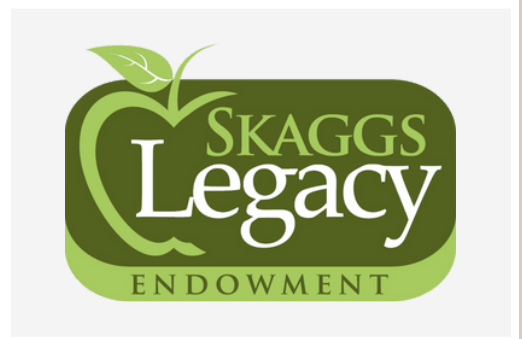
Skaggs Legacy Endowment Logo