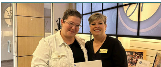
The Brook Wellness Center: Marijuana Brief Intervention Program

Supporting early intervention, school-based counseling, crisis care, and therapy services that help individuals and families build resilience and emotional well-being.