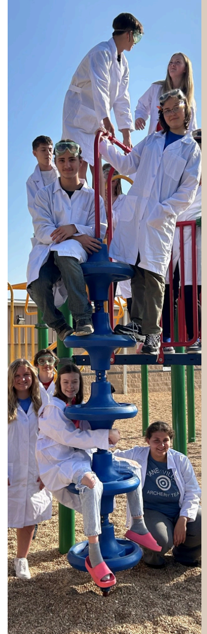
Taneyville School District: Missouri Science Olympiad