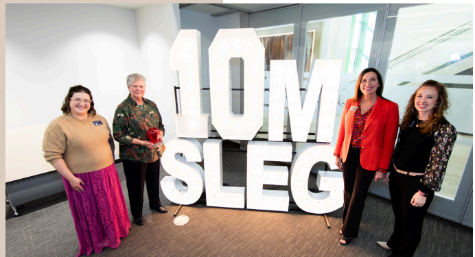
2024: $10M+ Awarded to the Community Since 2013