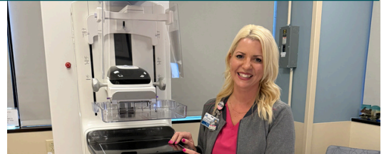
Cox Medical Center Branson: Women's Center Mammogram Machine

Improving access to essential services through transportation assistance, mobile outreach, and telehealth —so no one is left behind due to geography or income.