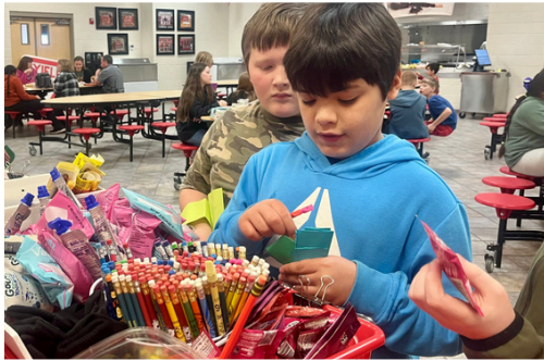
Public Schools: Cents of Pride Store