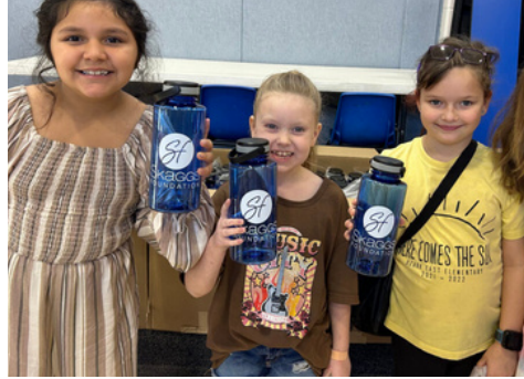
Water Bottles for Every Public School