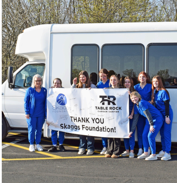
Table Rock Career Center: New Bus for Health Tech Students

Everyone deserves access to quality health and wellness resources.