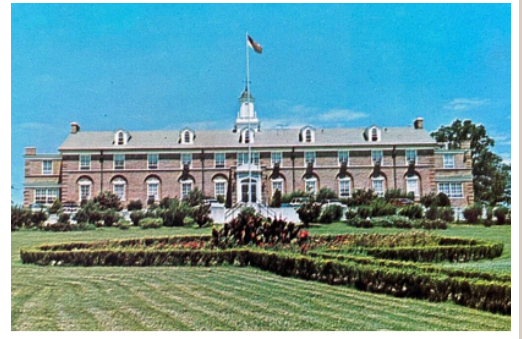
Skaggs Community Hospital - 1950

This story is still being written. And through your legacy, you can help shape its next chapter.