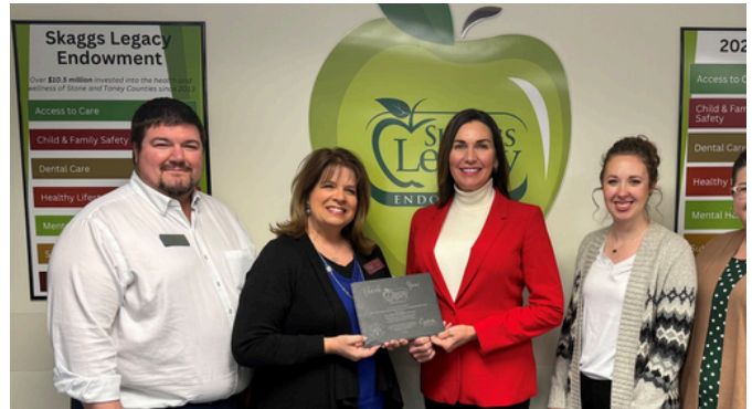
Options Pregnancy Clinic: Dad Prep Program

Our financial practices are rooted in transparency, accountability, and long-term sustainability. We undergo independent annual audits, and the Skaggs Legacy Endowment is one way we turn smart financial strategy into lasting community impact—funding meaningful projects without touching the principal.