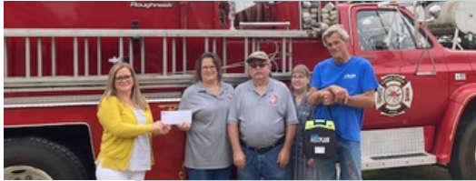
Cedarcreek Volunteer Fire Protect District: AED Equipment

Legacy giving not only helps strengthen your community—it also brings meaningful benefits to you and your loved ones. Here are just a few reasons why this kind of giving is so impactful: