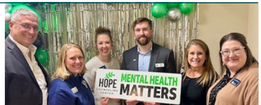
Hope Counseling Center

Promoting wellness through physical activity, nutrition programs, chronic disease prevention, and education that encourages lifelong healthy habits.