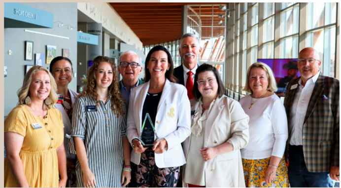
Skaggs Foundation Named 2025 Nonprofit of the Year