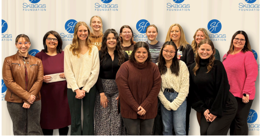
Healthcare Scholarship Recipients

Thanks to Skaggs Foundation's scholarship program, earning my BSN was far less financially straining on my family. Knowing how vital it is to keep local talent in our community, I joined the Skaggs Foundation Scholarship Committee, a group of medical and academic professionals committed to ensuring scholarships are awarded wisely.