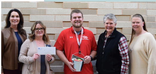
Reeds Spring Schools: Disc Golf

Whether you direct your gift to a specific program or allow Skaggs Foundation to use it where it's needed most, your contribution will make a difference.