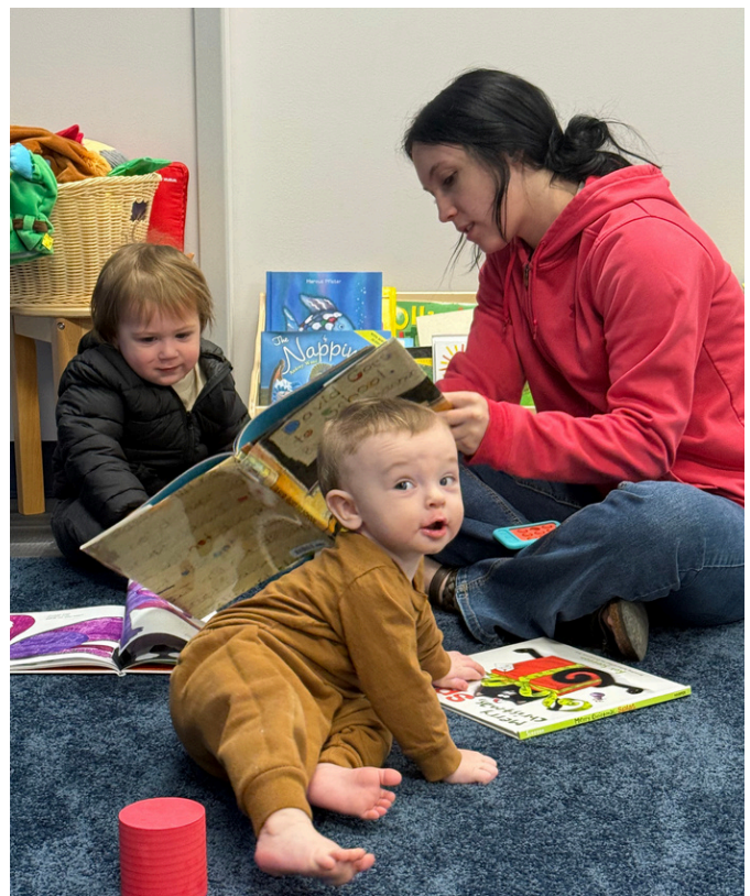
OTC Foundation: Jr. Eagles at Table Rock Childcare

Earning trust is one thing. Keeping it is everything.