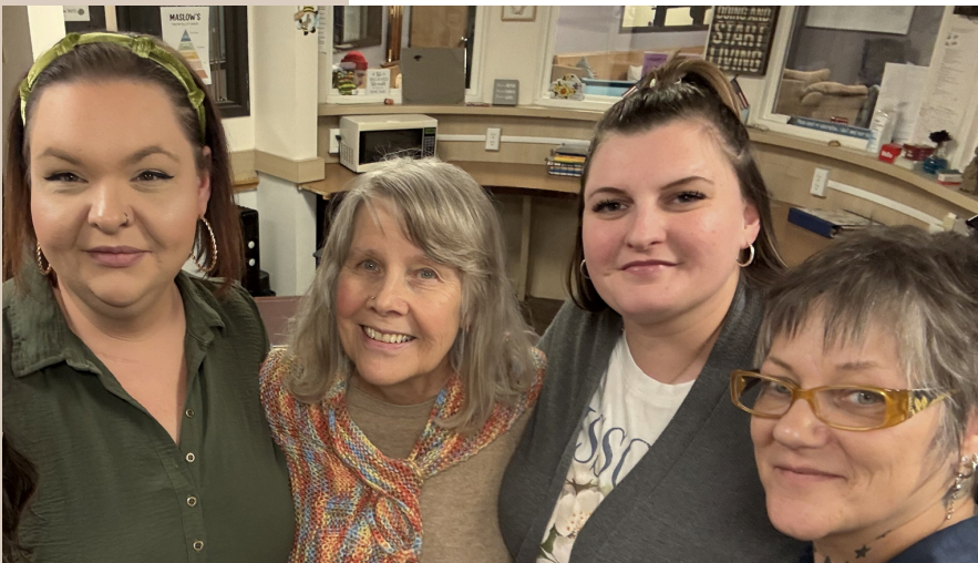
Simmering Center: Respite Care

DAFs offer a strategic way to give during your lifetime and leave a legacy by naming Skaggs Foundation to receive any remaining balance after your lifetime.