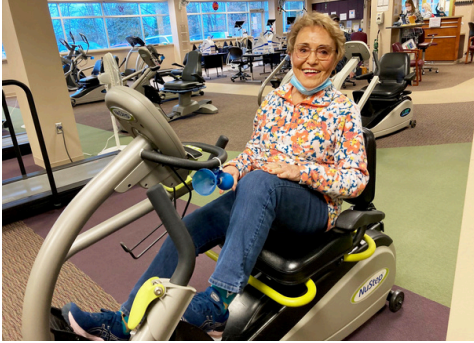
Cox Cardiopulmonary: Patient Scholarships

Creating a legacy is a personal and meaningful journey. Whether you're still exploring your options or ready to finalize your plans, these next steps will help guide the process with confidence and clarity: