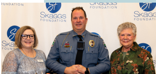
City of Kimberling City Police Department: AED Equipment

Many types of legacy gifts can reduce estate taxes or income taxes—especially gifts from retirement accounts or appreciated assets.