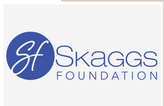
Current Skaggs Foundation Logo