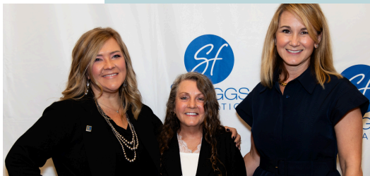
Charis-Group: Transportation Access

Your support lives on through programs that improve health and wellness in Stone and Taney counties.