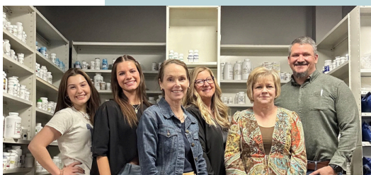
My Neighbor's Charitable Pharmacy: Staff

Most legacy gifts don't require you to give now. You can make a plan today that provides peace of mind and future impact.