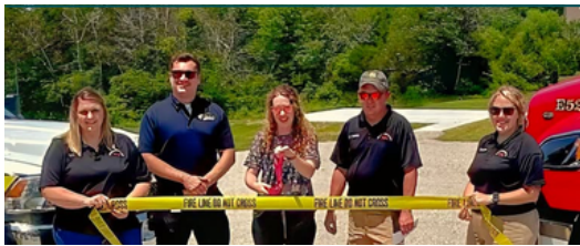
Central Taney Fire District: Helipad Ribbon Cutting