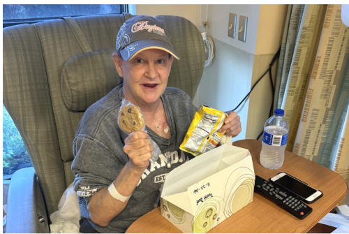
Cox Medical Center Branson: Cancer Center Meals